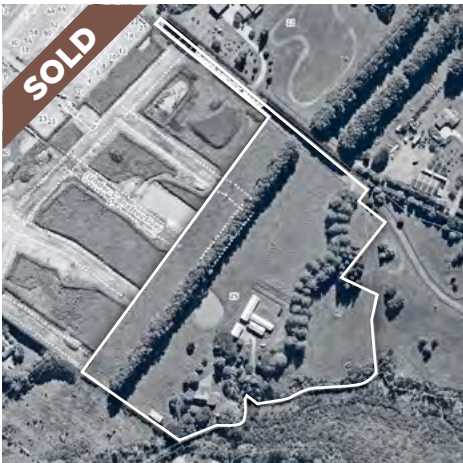
29 Tahingamanu Road Hobsonville, Auckland (4.4ha)