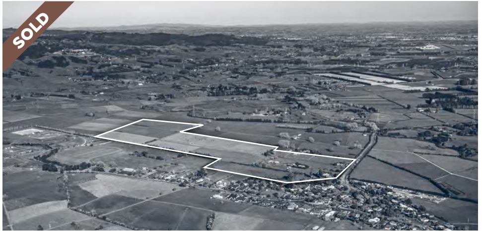
62-80 Papakura-Clevedon Road Clevedon, Auckland (31 ha)

T +64 (09) 304 1453 M +64 (21) 985 619 bruce.whillans@whillans.co.nz