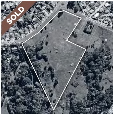
53 Schnapper Rock Road Albany, Auckland (4ha)