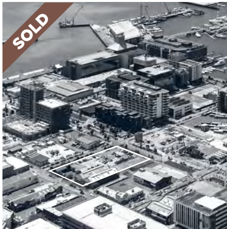
184-200 Pakenham Street Wynyard Quarter, Auckland (0.5ha)